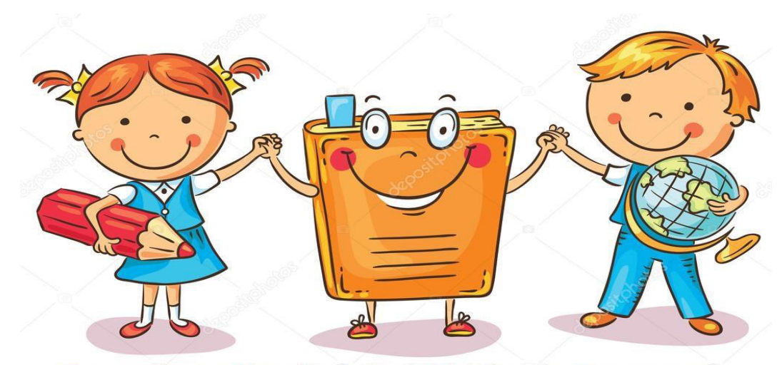
Compulsory Reading And Writing in Languages (CRAWL)

கற்றிலன் ஆயினும் கேட்க....!! Even if you are not educated..... Just listen...!!